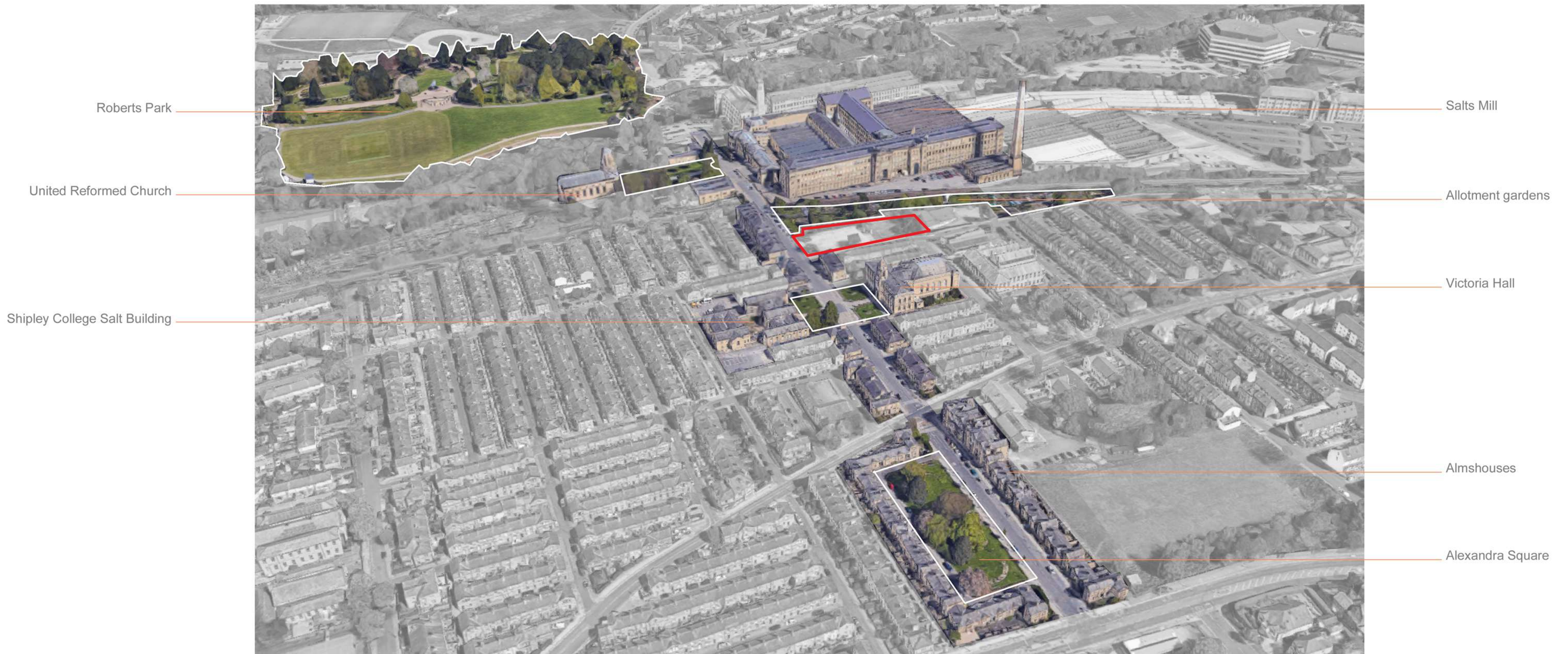
Victoria Road is the civic and public building spine of Saltaire

Our architects have looked at the setting, layout, street hierarchy and place-making principles that were central to Saltaire's original design to inform their design approach. Our new building will be part of the ensemble of civic buildings and spaces on Victoria Road and contribute positively to the World Heritage Site setting in its size, form, massing and external spaces.